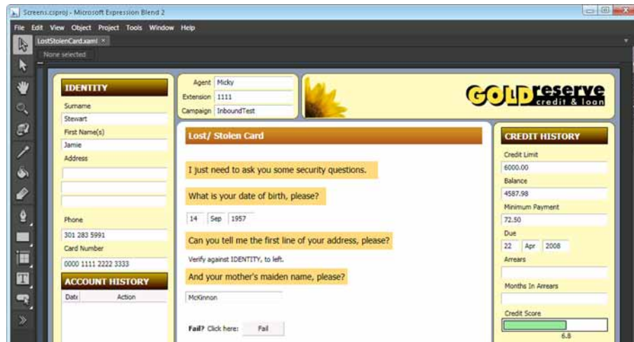
Figure 3 - Screen design with Microsoft Expression Blend

Screen Designer comes in two flavours; the built-in screen designer is ideal for generating medium complexity layouts while for very complex designs, scripter designer supports direct linking to Microsoft® Expression Blend®, one of the most powerful web design tools available today.