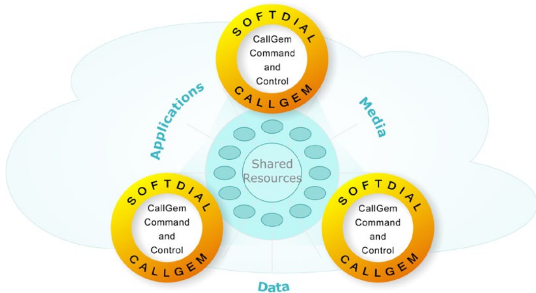
Figure 2 - 'Cloud' based hosting with Softdial Contact Center

At a time when the threat of identity theft is increasing alarmingly and PCI compliance is no longer optional for many call centers, Softdial's centralised security management, data encryption and data segregation features ensure compliance with the most demanding regulatory requirements.