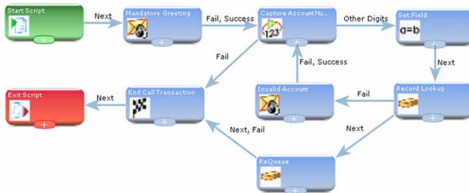
Figure 1 - Sample IVR Script designed in Softdial Scriptor™

Figure 1 shows a typical IVR script that has been designed in Softdial Scriptor™. The rectangular icons represent a few standard script 'steps' from over 50 provided with the software. To create a script the user simply drags the appropriate steps onto the design area. The steps are linked together by dragging an arrow link between them. Step outcomes are set during the one click linking process.