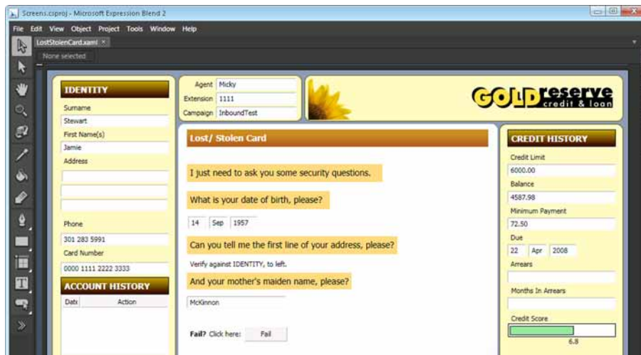
Figure 3 - Screen design with Microsoft Expression Blend

Screen Designer comes in two flavours; the built-in screen designer is ideal for generating medium complexity layouts while for very complex designs, scripiter designer supports direct linking to Microsoft® Expression Blend®, one of the most powerful web design tools available today.