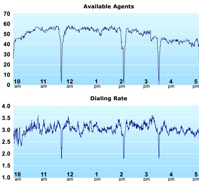
Figure 1. Instant pacing response to changing conditions

VEM® continuously monitors all events that are part of the dialing process. And it continuously reruns its calculations to update the dialing rate. Because of the power of VEM®, simulating at up to 40 million calls a second (yes, a second) this happens in milliseconds only. See Figure 1 for an example of how it responds immediately to changes in campaign conditions.